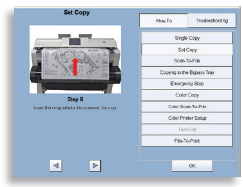
KIP 700m On Screen Operator Guides

KIP 700m system operation is simplified with direct access by the operator to the touchscreen system & operator guides. Remote access to the guides is achieved via KIP PrintNET web solutions.