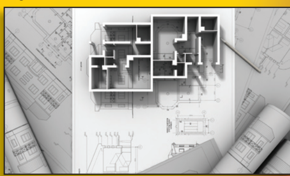
KIP 700m High Definition Printing

The KIP 700m delivers fast and accurate copies and prints using toner based imaging technology that produces UV stable prints. 100 % toner efficient KIP High Definition Print Technology ensures rich blacks and smooth gradients. Superior 600 x 600 dpi print, copy and scan resolution captures fine details with remarkable tone clarity, keeping reproductions true to the original.