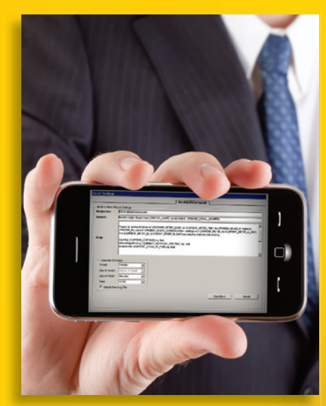
Reports Delivered Conveniently by Email