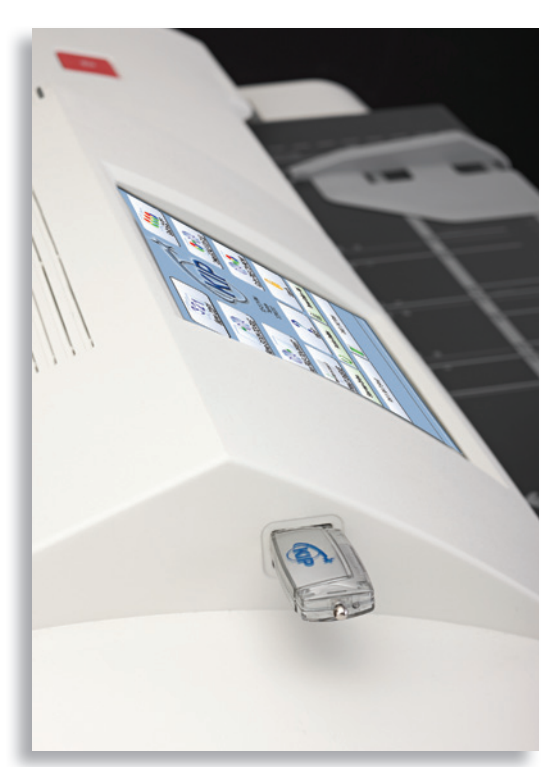
KIP 700m Integrated USB Port