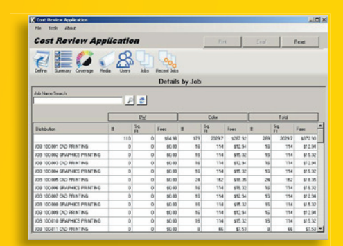
KIP Cost Review Application

The Energy Star® qualified KIP 700m employs adjust-able sleep modes to keep power consumption to a minimum while providing fast print times to keep busy workgroups moving. High yielding, 100 % efficient high definition toner delivers on the promise of maximum system uptime. In addition, the KIP 700m features a reduced maintenance cycle and colour coded snap-in parts designed to minimise maintenance times. The KIP 700m is part of KIP's initiative to ease environmental burdens in all stages of a product's life-cycle.