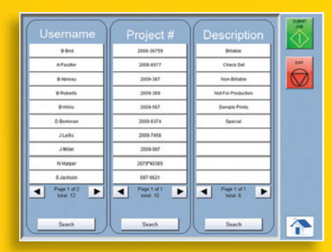
KIP Track Print, Copy & Scan Controls